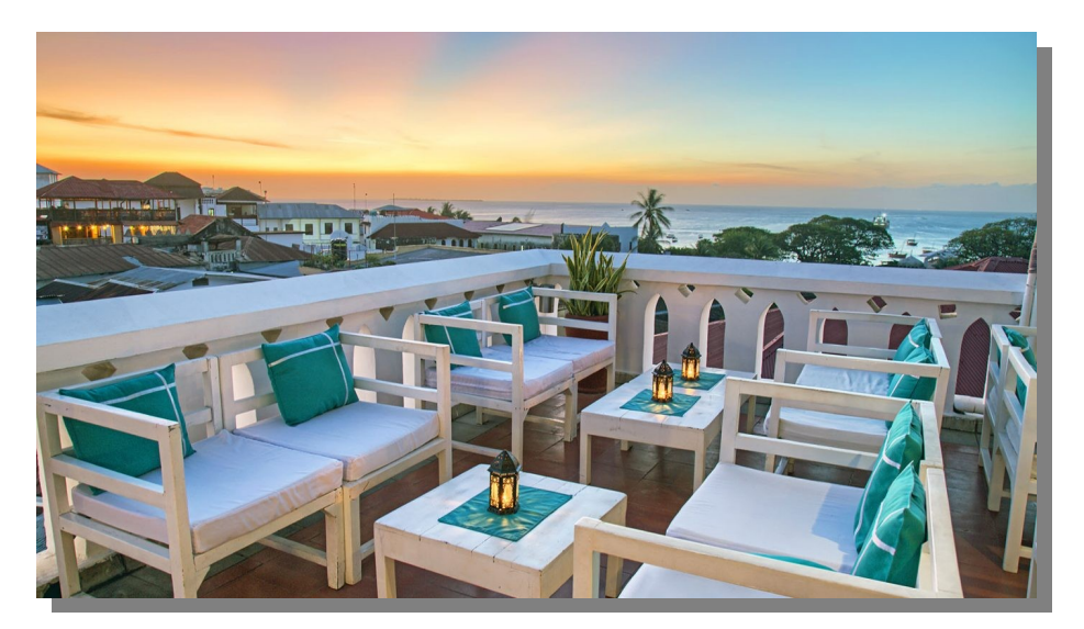
Maru Maru Hotel, Zanzibar

Situated at the heart of Zanzibar's Stone Town, The <u>Maru Maru Hotel</u> rests in a traditional Zanzibar House with a touch of modern facilities. It is a 2-minute walk from the Old Fort, a 6-minute walk to Darajani Market, and only 5 miles from Zanzibar International Airport. The Hotel has a rooftop terrace with a bar and offers amazing ocean and city views.