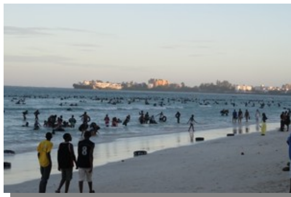
Jomo Kenyatta Public Beach, Mombasa

Kenya Bay Beach Hotel is located just eight miles from the coastal town of Mombasa. The hotel is beautifully set among Frangipani and Bougainvillea with some of the most breathtaking views of the Indian Ocean. The hotel has one of the largest beach frontages on the world-famous sandy Bamburi beach. An ocean-front pool under the shade of the palm trees that dot the well-manicured gardens can be enjoyed at any time of the day. All rooms are air-conditioned, have private balconies attached, and have bathrooms with large showers. Well-staffed, family-friendly, and comfortable restaurants overlooking the ocean serve many delicacies. From the hotel, a variety of places and activities of interest for engagement around Mombasa, including the nearby Bamburi Haller Park, can be accessed with ease.