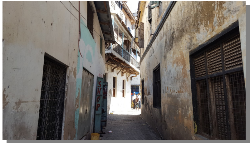
Mombasa Old Town

Mombasa Old Town is located on the southeastern side of Mombasa next to Fort Jesus, occupying an area of about 180 acres. It is inhabited by a mixed community of Arabs, Portuguese, Asians, and British. Study Tour participants will take a guided walk around the fort and learn more about the history of the area and about the East African slave trade era when the fort was used as a vantage point. They will also enjoy the exhibition of the wide collection of ceramics and pottery reflecting the various cultures that traded along the coast. Participants will also have an opportunity to visit the Mombasa Butterfly House, located on the premises of Fort Jesus and take a guided walk along Mombasa Old Town's narrow streets bordered by old buildings with ornately carved doors and balconies.