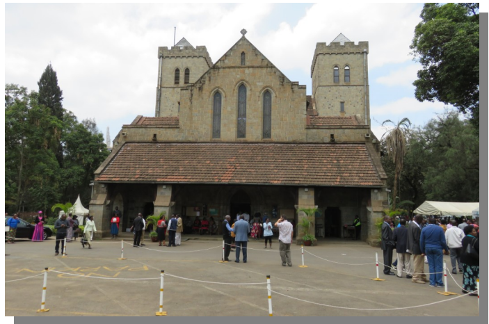
All Saints' Cathedral, Nairobi

Program Organizers are committed to providing an inclusive and accessible environment for all our program participants by supporting functional differences, disabilities, and any other special needs. If participants have any specific needs that we might be able to accommodate during the program or have requirements for extra time or resources, please let us know in advance so that we can do our best to assist them. As part of the pre-departure processes, the Program Designers will ensure that participants complete the Participant Information Form which asks for details of any allergies, medical conditions, and other special needs.