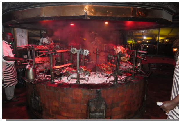
The Carnivore, Nairobi

EDU Africa will facilitate virtual preparation sessions for program participants, providing them with important health, safety and cultural information before travel.